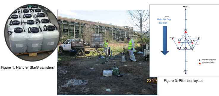
Figure 2. Spanish pilot test works e

Before, during and 6 months after the injection application, real-time geochemical maesurements (pH, temperature, redox potential- ORP, electrical conductivity - EC and dissolved oxygen - DO) have been recorded and periodic groundwater samples have been taken in order to understand nZVI's effectivity and behavior under real conditions.