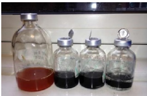
Figure 5. Ferrihydrite (left), large bottle is control without bacteria and the three small bottles are replicates containing Geobacter sulfurreducens , which is reducing ferrihydrite to form bionanomagnetite.

Bionanomagnetites are a developing nanotechnology which would be expected to be market ready in 1 to 5 years.