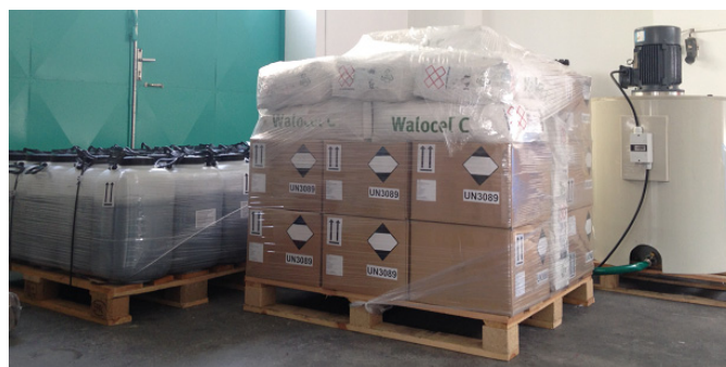
Figure 1. Photograph showing nanoremediation products and equipment prior to departure to the NanoRem Spolchemie I site. On the left are plastic barrels containing NANO FER 25S slurry, in the middle are boxes of NANO FER STAR, together with bags of the stabiliser carboxymethyl cellulose, and on the right is the dispersing unit

The high chemical reactivity of nZVI particles means that their specific activity and ability to move through the subsurface can be limited by a number of processes within the subsurface, namely, agglomeration, passivation and sorption onto material within the aquifer. To help overcome these problems, and thus increase the usefulness of nZVI in remediation, a number of modifications to the NPs have been developed, including: stabilisation, emulsification, anchoring the