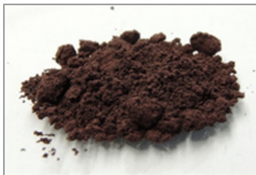
Figure 6. \text{BaFeO}_4 sample.

Ferrate(VI) salts are very strong oxidants and could hence be a promising agent for water and wastewater treatment processes. Barium ferrates ( \text{BaFeO}_4 ) offers slow-release properties and could hence be utilised to create a depot effect in the aquifer. Ferrate(VI) is synthesised electrochemically; barium ferrate is obtained by subsequent precipitation (Figure 6). In order to investigate the reactivity of barium ferrate towards BTEX contaminants batch tests have been conducted using toluene as a model contaminant. This is a bench-scale research concept being tested by VEGAS, University of Stuttgart, which has not yet seen field deployment.