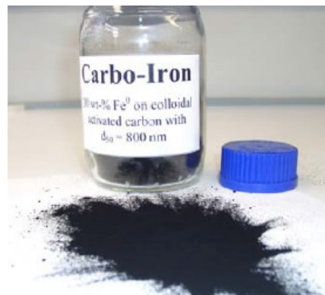
Figure 4. Carbo-Iron® is an air-stable powder.

Carbo-Iron® is an air-stable in situ reagent developed at The Helmholtz Centre for Environmental Research - UFZ (Figure 4) targeting halogenated organic contaminants or heavy metals in groundwater. Carbo-Iron® consists of activated carbon colloids which are doped inside with nanoiron structures (mean cluster size around 50 nm, ZVI content 20-30 wt%). Both materials contribute to the particle properties. The porous composite has an effective density in water of approximately 1.7\ \text{g cm}^{-3} which in combination with its optimised size and surface properties ensures an effective subsurface transport of the reagent particles. Carbo-Iron® has been field tested and is commercially available from SciDre GmbH.